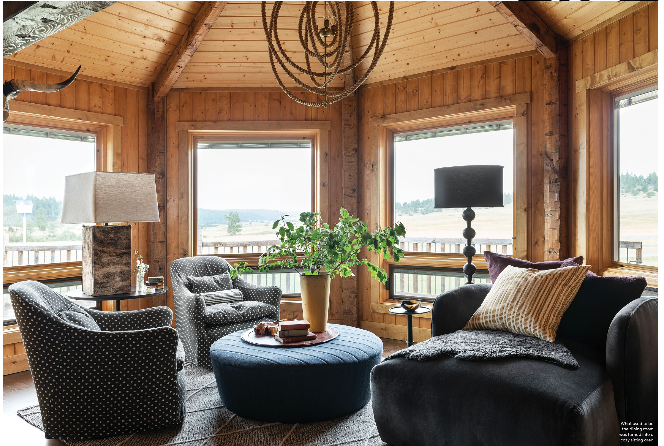
What used to be the dining room was turned into a cozy sitting area