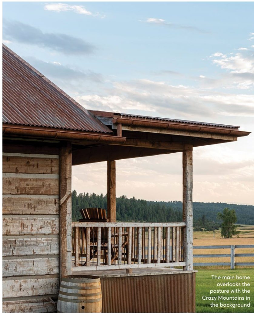
The main home overlooks the pasture with the Crazy Mountains in the background