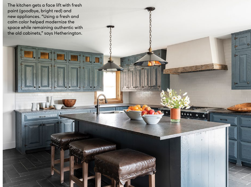
The kitchen gets a face lift with fresh paint (goodbye, bright red) and new appliances. "Using a fresh and calm color helped modernize the space while remaining authentic with the old cabinets," says Hetherington.