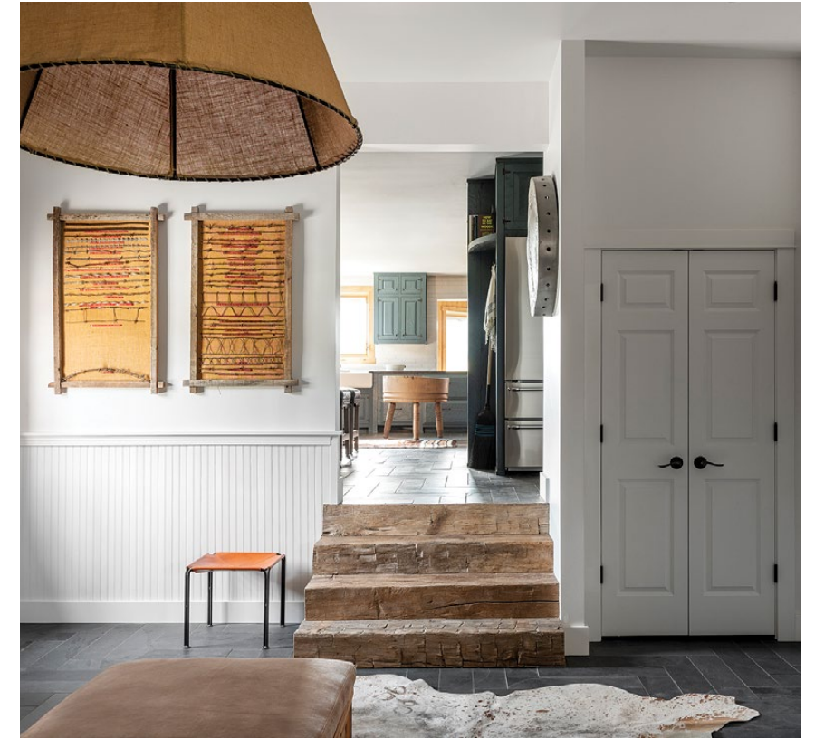
A mudroom off the kitchen where the family can kick off their muddy boots.