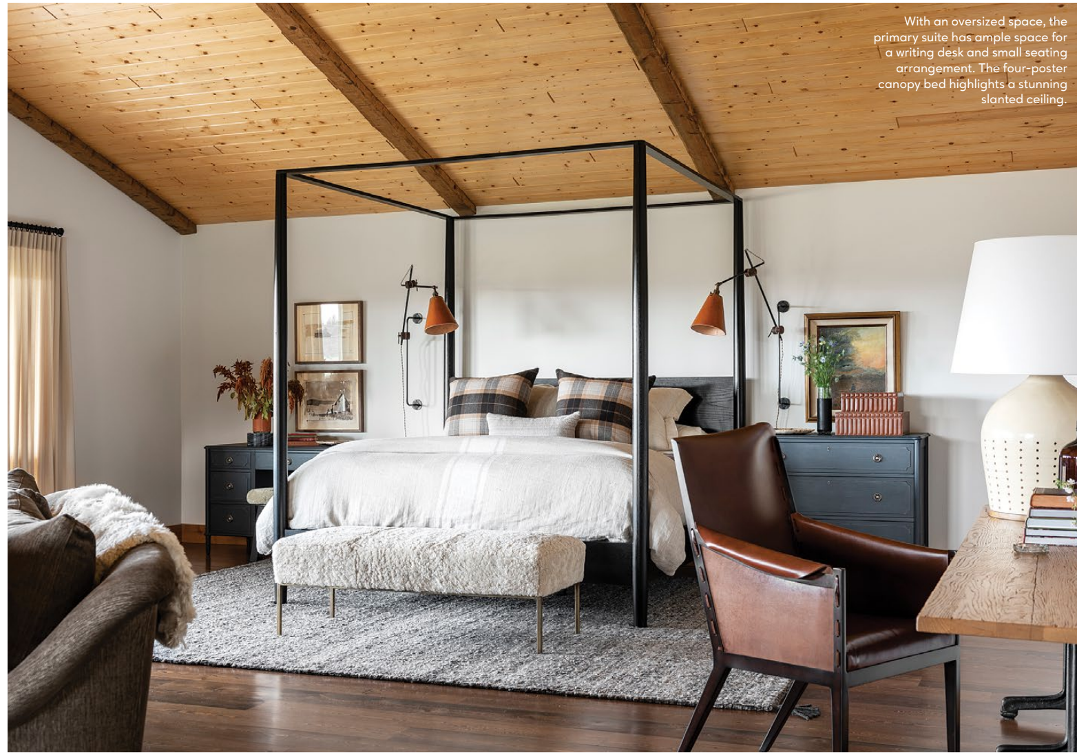
With an oversized space, the primary suite has ample space for a writing desk and small seating arrangement. The four-poster canopy bed highlights a stunning slanted ceiling.