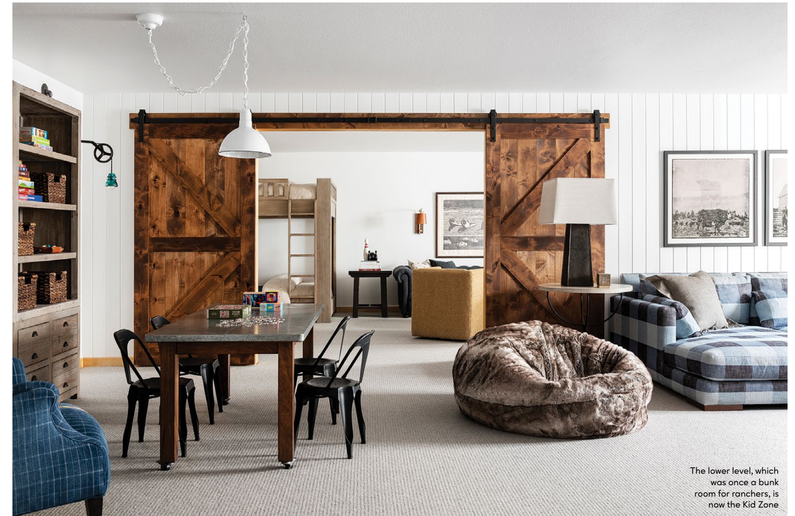
The lower level, which was once a bunk room for ranchers, is now the Kid Zone.